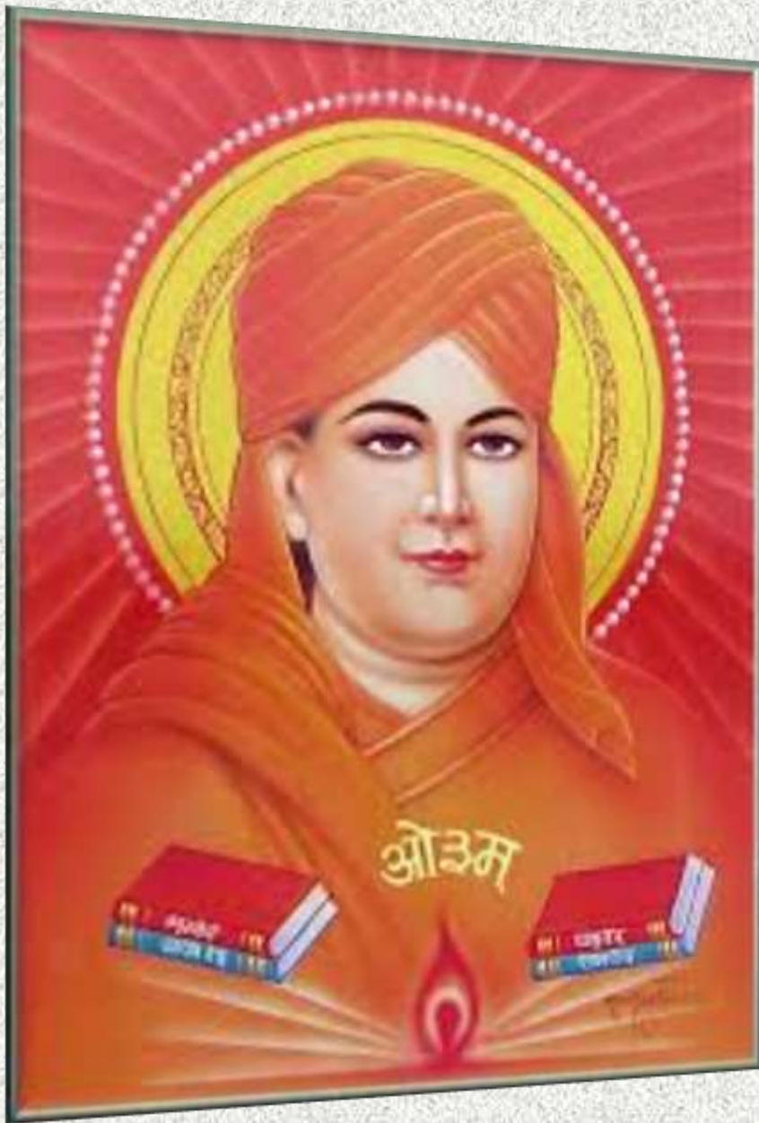
MAHARISHI SWAMI DAYANAND SARASWATI ( 1824 – 1883 )