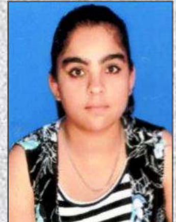
Palvi 3rd Position Knitting